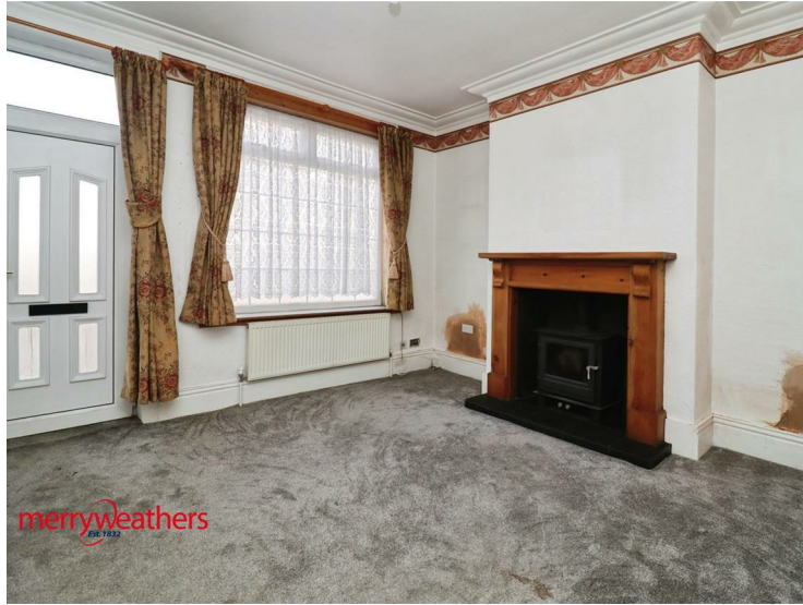
LOUNGE 12'5" x 12'2" (3.81m x 3.71m)

With uPVC door and window, two radiators and recessed stove