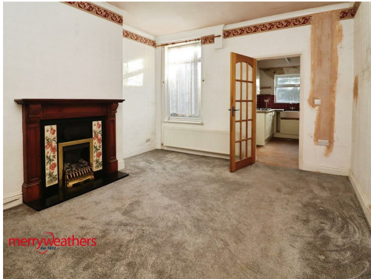
DINING ROOM 12'5" x 13'3" (3.8m x 4.05m)

With radiator, rear facing uPVC window, built-in storage cupboard and Cellar leading off