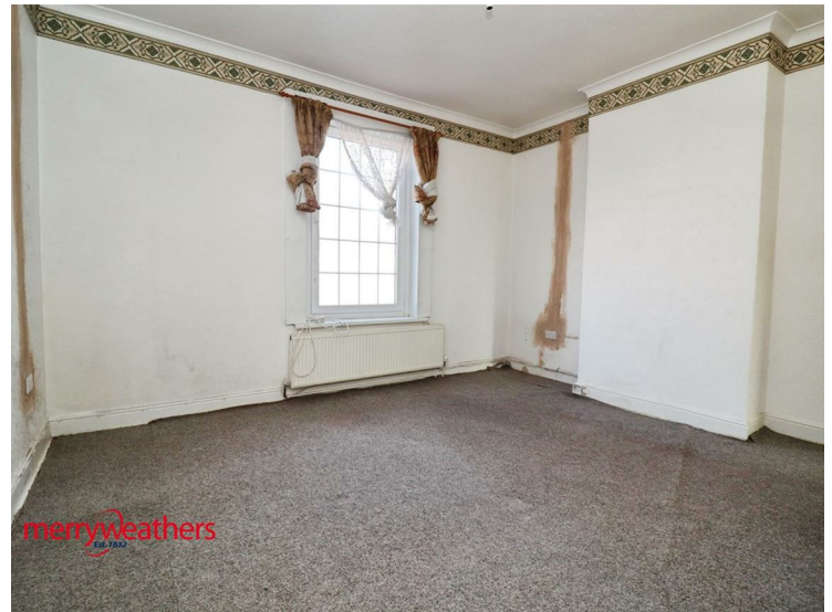
FRONT BEDROOM 13'11" x 12'2" (4.26m x 3.72m)

With radiator, uPVC window and built-in cupboard