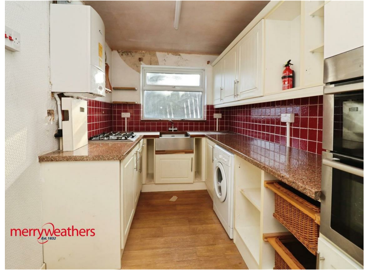
KITCHEN 6'11" x 11'5" (2.12m x 3.5m)

With fitted base and wall cupboards and stainless steel sink set beneath a rear facing uPVC window. Integrated gas hob and double oven, space and plumbing for washing machine and wall-mounted 'Worcester' gas combi boiler.